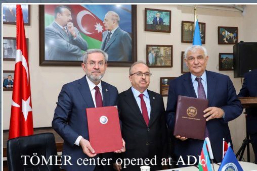
TÖMER center opened at ADU

An academic cooperation agreement has been signed between Azerbaijan University of Languages (ADU) and Ankara University TOMER (Turkish and Foreign Languages Research and Application Center of Ankara University).