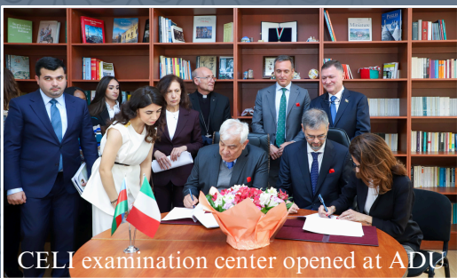
CELI examination center opened at ADU

The CELI (Certificato di Conoscenza della Lingua Italiana) exam center was opened at the Azerbaijan University of Languages.